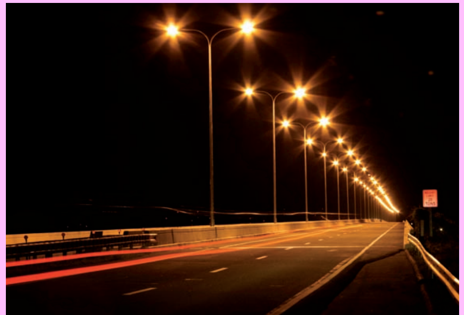
Sacobia Bamban bridge at night

For the safety and convenience of motorists, security teams are strategically deployed along the tollway to ensure that help is just 20 minutes away at any point along the SCTEX. Motorists needing