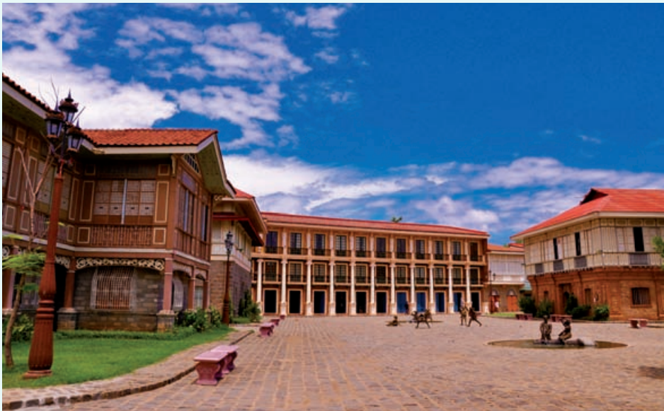
Las Casas Filipinas de Acuzar

Summer has ended and the new school year has already started. But this does not mean plans for the next family outing must be put on hold until the Christmas break or, worse, until next summer.