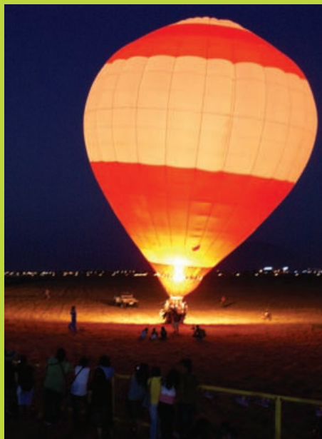
As early as 5:00 AM, crowds gather to witness how balloons are being prepared before they float into the air.

The Tollways Management Corporation (TMC), interim service provider for the SCTEX, was also tasked to draw up contingency plans that ensured faster, safer and more comfortable travel along the 93.7-kilometer toll road.