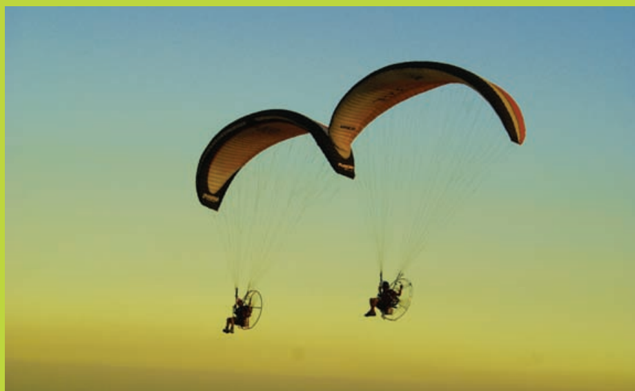
A weekend of everything that flies. Aside from the colorful balloons, tourists also enjoyed watching other activities such as paragliding.

"Due to the huge package of spectacular events, we have anticipated significant increase in traffic volumes at the SCTEX which is now more accessible to motorists and passengers alike with the completion of all its 11 interchanges," Gervacio said.