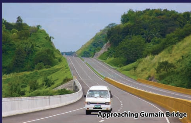
Approaching Gumain Bridge

Do you want to publish your SCTEX photos? Then send it to bcda.pa@gmail.com with your name, address and contact number. Your photos could be featured on this page.