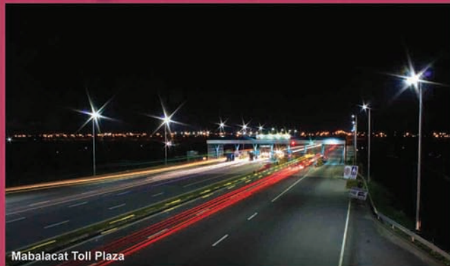
Mabalacat Toll Plaza