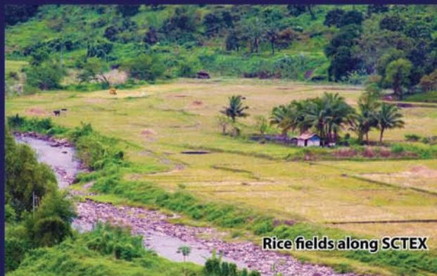
Rice fields along SCTEX